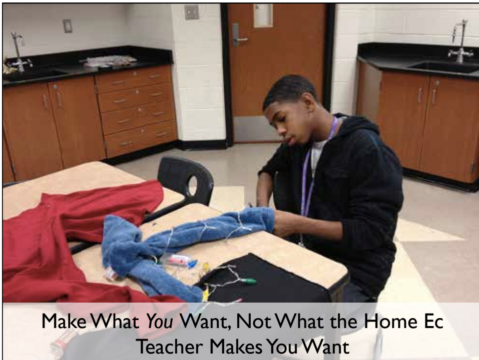
Make What You Want, Not What the Home Ec Teacher Makes You Want