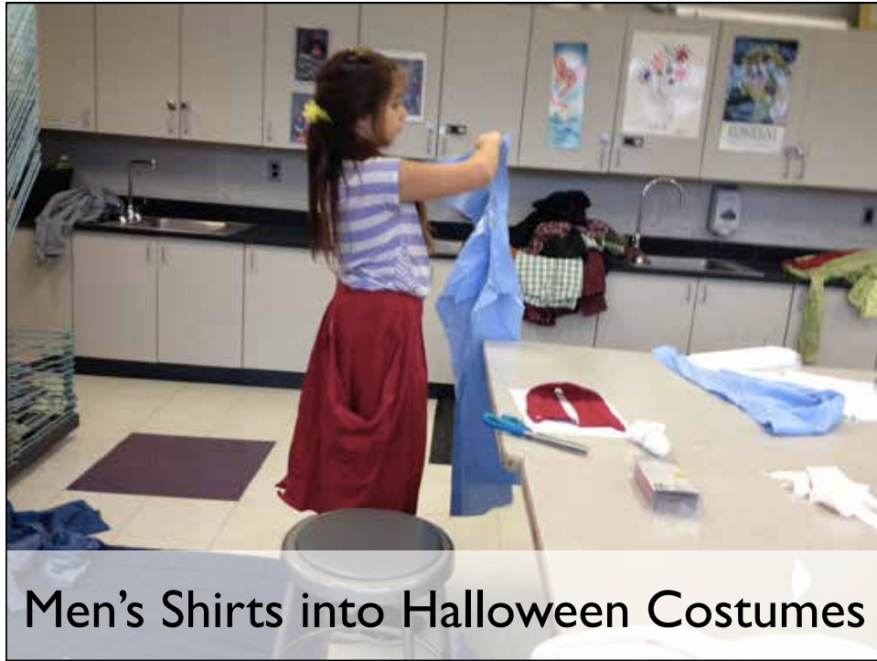
Men's Shirts into Halloween Costumes