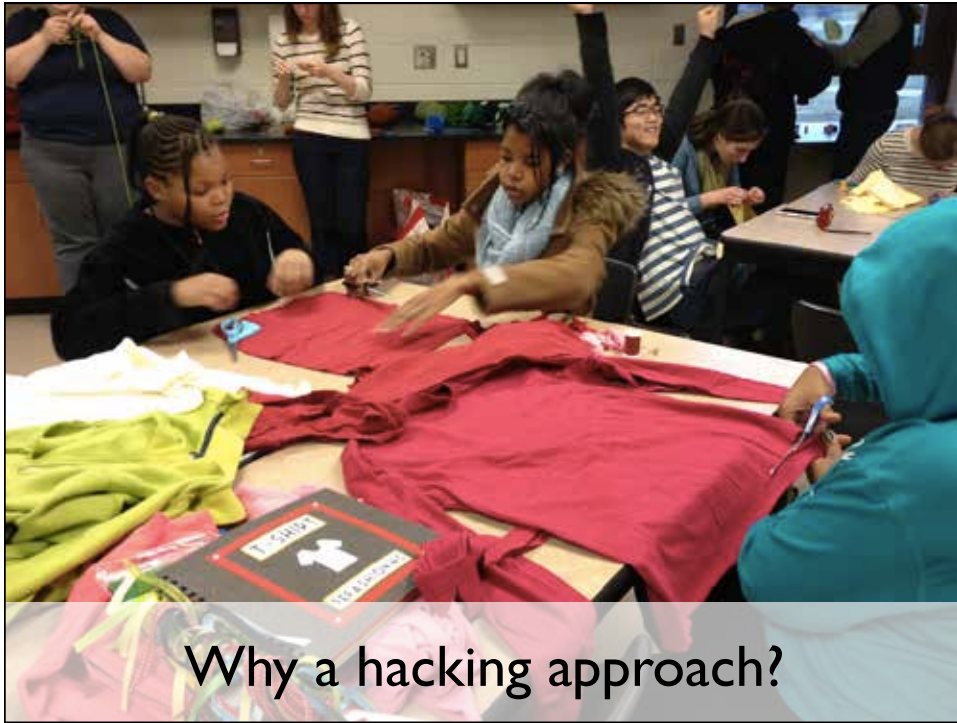
Why a hacking approach?