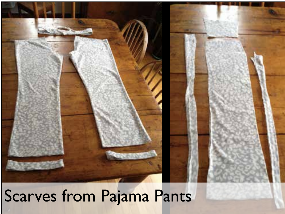
Scarves from Pajama Pants