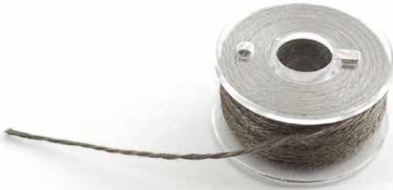
Conductive thread image from adafruit.com