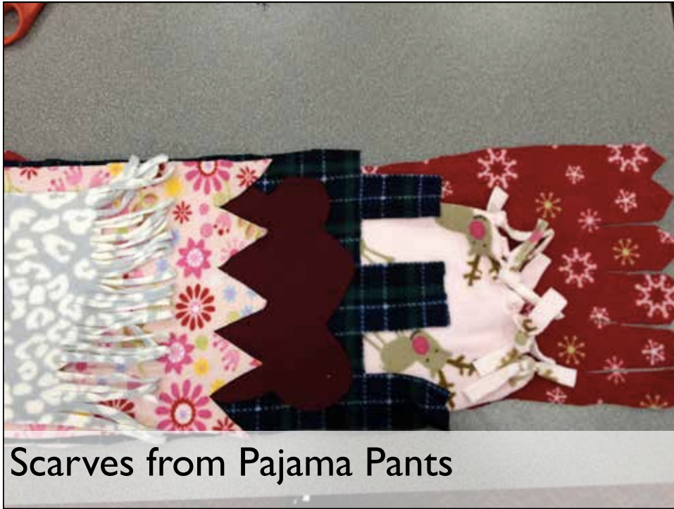
Scarves from Pajama Pants